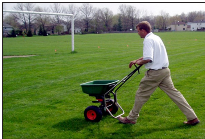
Fertilizer Application