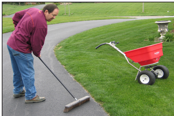
Fertilizer removal from hardscapes