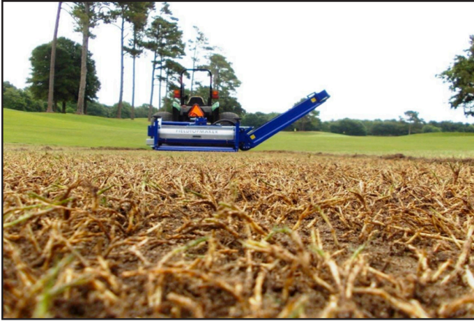
Exposed rhizomes and stolons following fraze mowing – Photo courtesy of Pamela Sherratt

Improved seed germination. If a field is seeded following fraze mowing, seed germination increases because of improved seed to soil contact. To compare, when thatch is present, lower seed germination can be expected. Seed germination is also successful because there is little competition from weeds or other vegetation. Seeding is also desirable following fraze mowing because a denser stand of grass can be achieved from existing roots, rhizomes, and crowns growing in along with new seedlings.