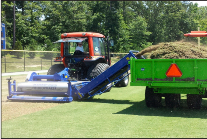
Frazé mowing Patriot bermudagrass

great number of living stems in the debris, it might also be transplanted (i.e. sprigged) into a prepared soil as a means of vegetative establishment. This is commonly done with debris generated from frazé mowing bermudagrass.