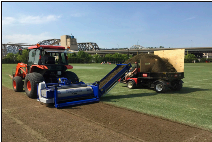
Frazé mowing Cincinnati Bengals practice facility

Frazé mowing was invented in 1996 by Ko Rodenburg, parks superintendent for Rotterdam, Netherlands. In an effort to renovate cool season turfgrasses, he created a machine that successfully removed 100 percent of the thatch and organic matter that would build up over the course of a growing season. Since only the top layer was removed, roots, rhizomes, and crowns remained to allow for Kentucky bluegrass and perennial ryegrass to regenerate.