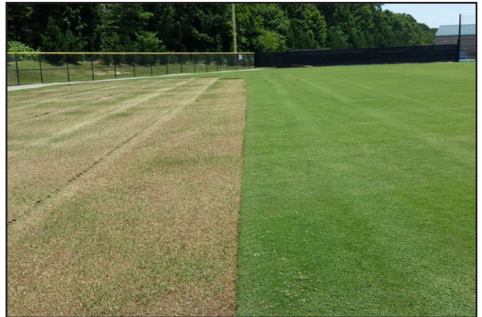
Frazé mowed bermudagrass (left) compared to non-frazé mowed bermudagrass (right) – Photo courtesy of Dr. Mike Goatley

weeds and weed seeds were removed with fraze mowing, some weeds may appear during the recovery process. If an herbicide is necessary to control weeds, be sure to refer to the label for specific instructions for effective application. Mowing may begin when new plants reach 1-2 inches tall.