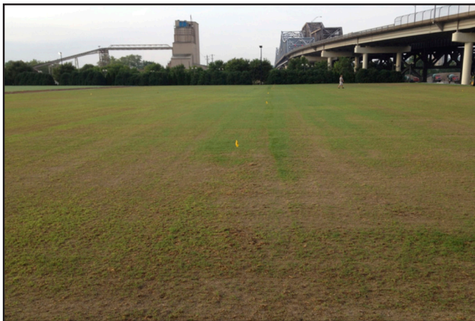
Patriot bermudagrass recovery 6 days following fraze mowing at Cincinnati Bengals practice facility

Quicker recovery rates have been observed with perennial ryegrass and bermudagrass at sports facilities experimenting with fraze mowing. It obviously depends on the time of year the fraze mowing is conducted and the cultivar being mowed, but bermudagrass recovery from fraze mowing is anticipated to be much quicker than for Kentucky bluegrass when done properly. On average, almost complete recovery of the playing surface is anticipated within 4-6 weeks under ideal growing conditions. On sand-based bermudagrass fields at the University of Missouri, recovery time can be much faster than seeding Kentucky bluegrass into native soil. Fertilizer applications immediately after fraze mowing can produce 90 to 95 percent recovery in three weeks. On test plots at the University of Missouri Turfgrass Research Center, similar results are seen with bermudagrass on native soils. Recovery of fields following fraze mowing is very species dependent.