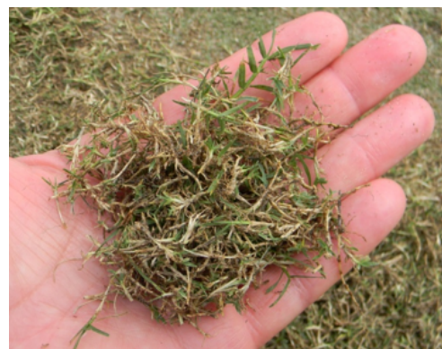
Bermudagrass sprigs