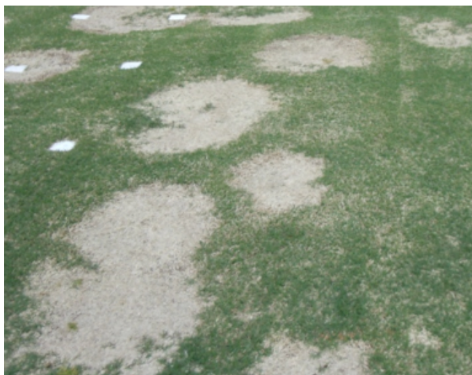
Spring dead spot - Photo courtesy of Cale Bigelow, Ph.D., Gregg Munshaw, Ph.D.

If turf blankets are being used, carefully monitor the area for disease. Warm, wet weather during the winter can increase the likelihood for disease appearance. Fungicide applications may be necessary depending on winter weather.