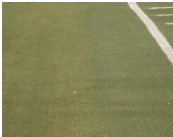
Bermudagrass (Tif-Sport – left; Patriot – right)