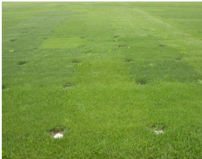
Kentucky Bluegrass cultivar diversity - Photo courtesy of Cale Bigelow, Ph.D., Gregg Munshaw, Ph.D.