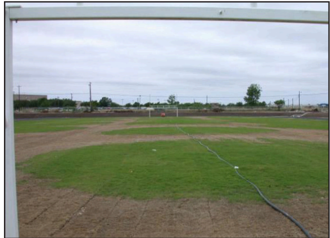
Results of poor head-to-head coverage – Photo courtesy of Jeff Gilbert