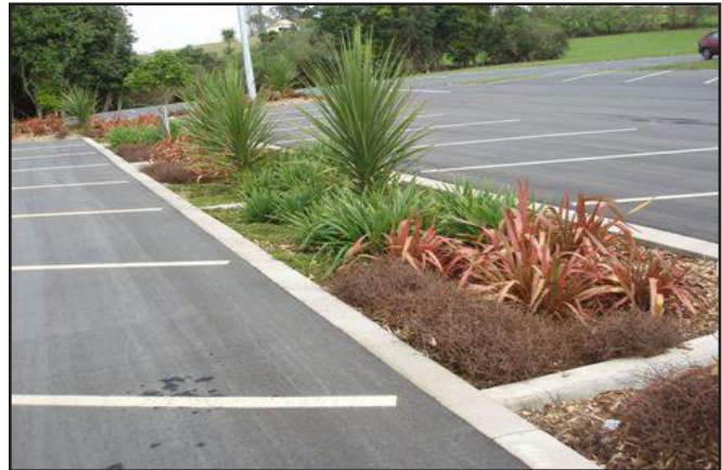
Landscaping alternative to narrow strip of turfgrass