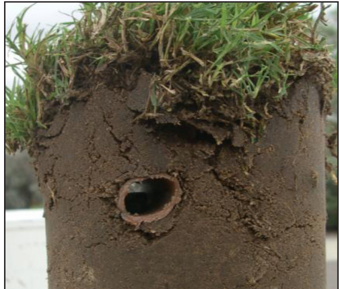
Drip irrigation system