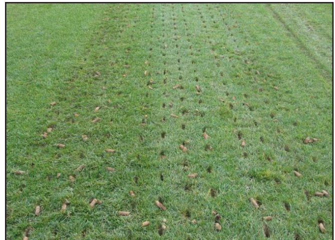
Core aeration – Photo courtesy of Mike Goatley, Jr., Ph.D.

impact. Aeration is also effective for managing thatch. When thatch accumulates to levels over 1/3-1/2 inches, roots may be restricted to the poor water holding environment of the thatch. Thatch can also promote runoff, which reduces irrigation efficiency and increases environmental impact. Frequent aeration practices are effective at reducing water runoff, promoting water infiltration, and encouraging deep percolation within the rootzone to produce a healthier and deeper turfgrass root system. Athletic surfaces should be aerated on a frequent basis, with some areas receiving aeration up to twice per month during the playing season.