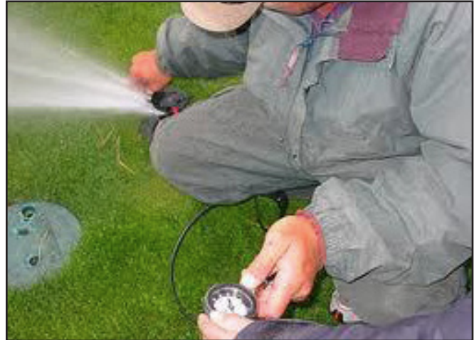
Pressure test

or valves that can be retrofitted to pressure regulation. Providing pressure regulation at each valve-in-head sprinkler and each remote control valve may be desirable. However, pressure regulation can rob up to 10 pounds of pressure from the dynamic operating pressure; therefore, on lower pressure systems, it can adversely affect sprinkler performance.