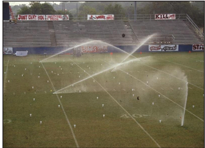
Irrigation Audit