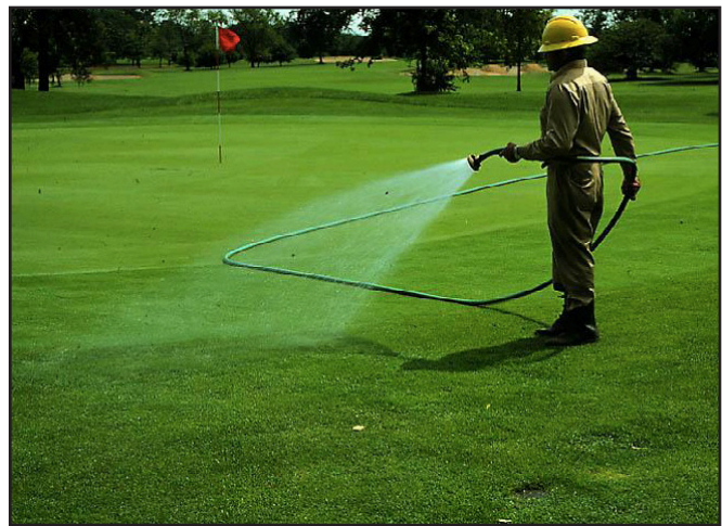
Handwatering