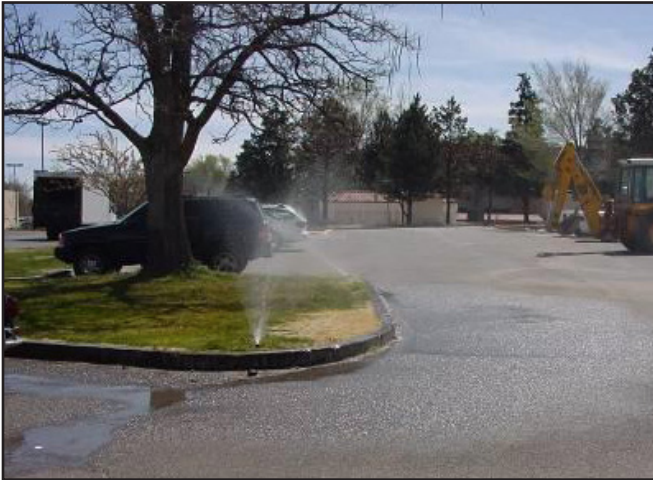
Make sure sprinklers are adjusted to hit landscaped areas – Photo courtesy of Bernd Leinauer, Ph.D.

or valves that can be retrofitted to pressure regulation. Providing pressure regulation at each valve-in-head sprinkler and each remote control valve may be desirable. However, pressure regulation can rob up to 10 pounds of pressure from the dynamic operating pressure; therefore, on lower pressure systems, it can adversely affect sprinkler performance.