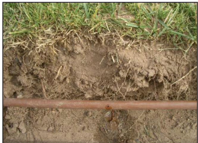
Drip irrigation system – Photo courtesy of Bernd Leinauer, Ph.D.