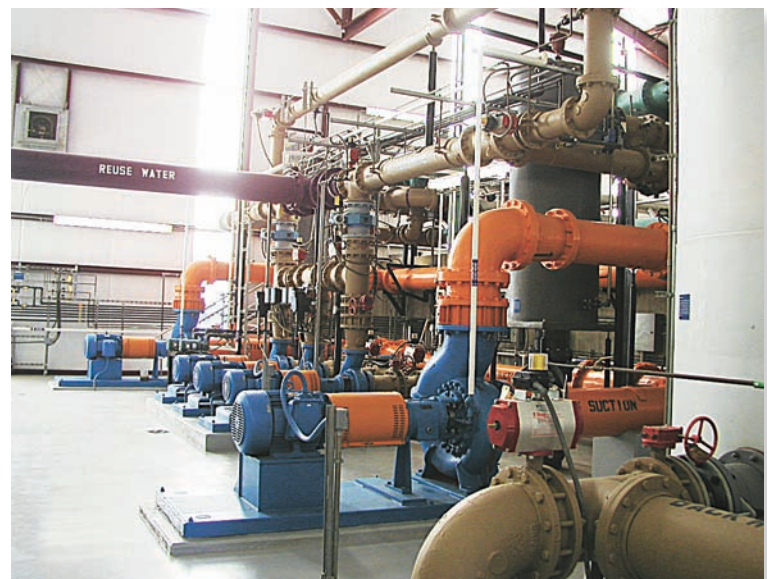
Atlanta Athletic Club's source for irrigation water is no longer the Chattahoochee River but high-quality recycled water from the Cauley Creek treatment plant.

Golf courses in the U.S. range in size from 50 to 200 acres, and the average size of a typical 18-hole golf facility is 150 acres. The maintained turf areas average approximately 100 acres, encompassing an average 3 acres of greens, 3 acres