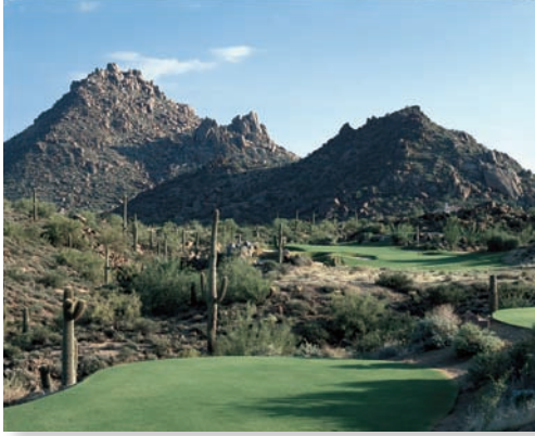
In the late 1990s, the city of Scottsdale, Ariz., mandated that Troon G&CC and other courses in the city begin irrigating with recycled water.

a pond of potable water. Local laws may require the use of liners for lakes converted for storage of recycled water to prevent potential groundwater contamination.