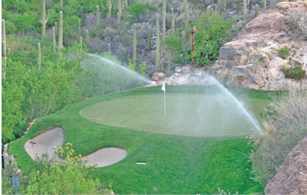
Along with many other golf courses in the United States, Ventana Canyon Golf & Racquet Club in Tucson, Ariz., irrigates with recycled water.

suitable for limited reuse, including irrigation. Recycled water is also referred to as reclaimed water, wastewater, effluent water, treated effluent water and treated sewage water. In this document, the term recycled water will be used.