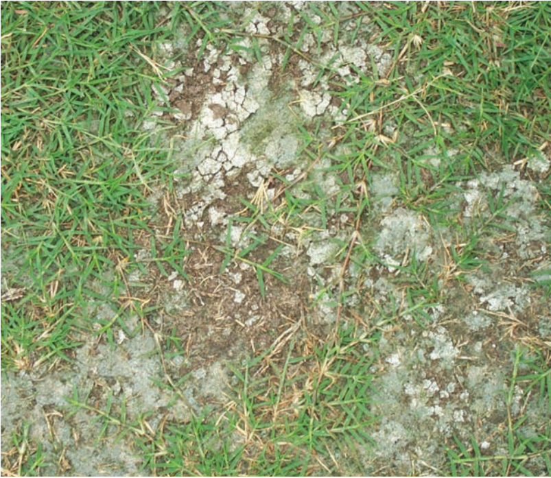
The water used to irrigate this loam soil had an EC of 1.48 to 1.77, and the adjusted SAR was 8 to 10, making it impossible for turf to survive in the salt-encrusted soil.

of tees, 30 acres of fairways, 50 acres of roughs, 9 acres of practice areas and 5 acres of other landscape areas. Non-turf areas at golf facilities include water features such as lakes, ponds or streams; natural areas; buildings; parking lots; and golf car paths. Course design today routinely incorporates natural areas or areas that are not maintained to preserve environmental integrity and to reduce maintenance costs.