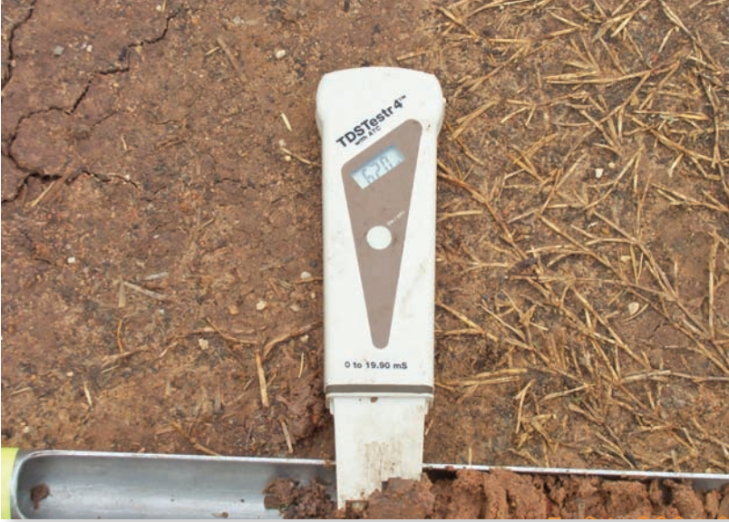
The salinity of this Texas loam soil was measured in the field. The 6.2 soil EC reading on the meter equals approximately 17.5 deciSeimens/meter (11,200 ppm TDS) according to a lab test with the saturated paste method.

these grasses, because they are generally stressed by being cut very short and because sodium accumulation will affect a large portion of the remaining leaf tissue.