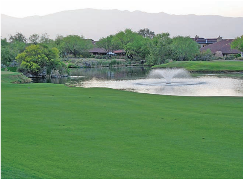
Storage lakes on the golf course are often used to store recycled water when the course cannot use the daily water allotment it is required to accept.