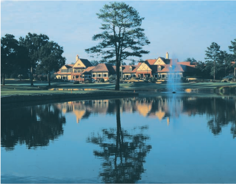
Atlanta Athletic Club

amounts. At concentrations as low as 1 to 2 milligrams/liter in irrigation water, it is toxic to most ornamental plants and capable of causing leaf burn (Table 1). Injury is most obvious as necrosis on the margins of older leaves. Turfgrasses are generally more tolerant of boron than other plants grown on a golf course. Most turfgrass species may tolerate soils with boron levels as high as 10 ppm.