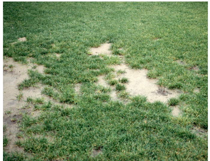
Standing water on an athletic surface

The ease with which water can move through soil is permeability. Infiltration, water entering the soil, and percolation, water moving through the soil, are components of permeability. Infiltration and percolation are measured in inches per hour. Movement of water into and through the soil profile is affected by soil texture, soil structure, and compaction. A field surface is kept free of water most effectively when some water can pass downward though the soil to assist removal by positive surface drainage. If infiltration and percolation are inhibited, water will remain on the surface and rely primarily on surface drainage.