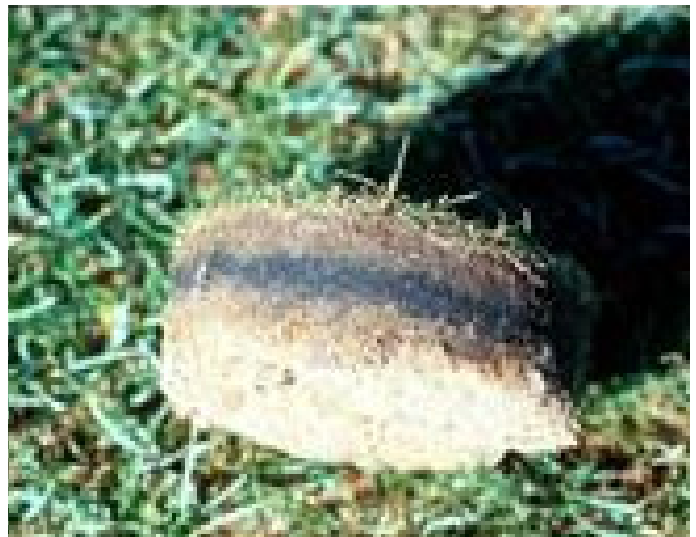
Black Layer

One of the most common problems associated with poor internal drainage is layering within the rootzone. Layering often results from a series of successive cultural practices in which soils of different textures are incorporated into the field. This includes topdressing and/or reincorporating soil cores following hollow tine aeration. As coarse-textured soils are placed over fine-textured soils, or vice versa, a water table can develop. Water tables impede internal drainage by restricting water movement. Fine soil particles over coarse soil particles can cause a perched water table and create a saturated, unstable soil surface. Coarse soil particles over fine soil particles can cause a temporary water table. Depending on weather conditions, a temporary water table can cause the soil surface to dry out quickly. Another problem seen with temporary water tables is the formation of black layer. If the movement of water into the underlying fine layer is prolonged over a long period of time, anaerobic soil conditions can develop and lead to black layer.